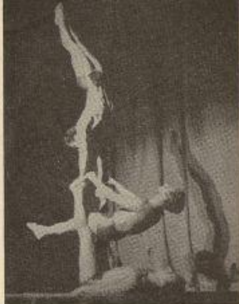
Les Trois des Milles