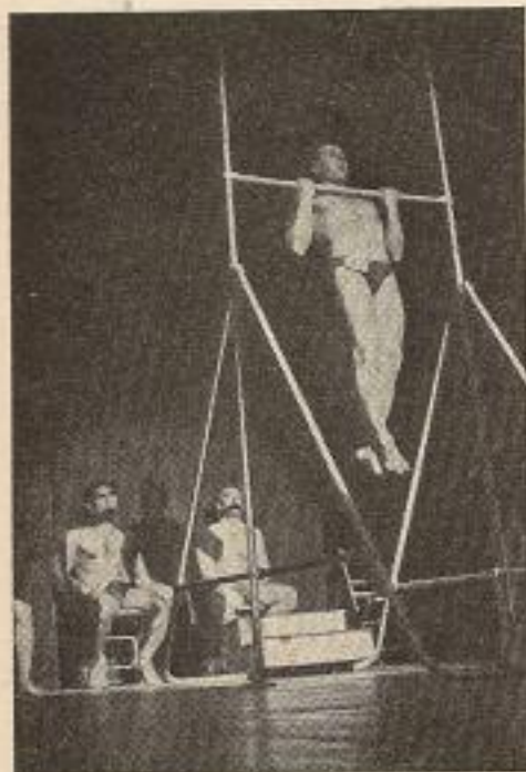
International skinning contest