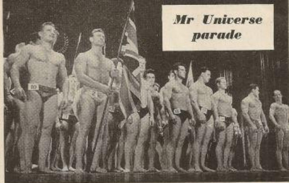
The Mr Universe competitors fill the vast Palladium stage at the start of the show

and music filled the vast Palladium auditorium. Programmes rustled open while the compere said his introductory piece, and over 2,000 fans leaned forward in their seats as the curtain went up on the Parade of Mr. Universe competitors. The show had begun!