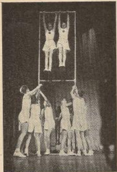
NABC boys club team