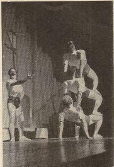
The Four Hercules